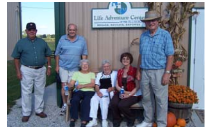
Members of the Class of 1951

"The facilitators at LAC were FABULOUS! We all enjoyed bonding as a group" - UK School of Music