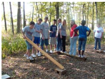
Anderson County High School working to solve a tough chal- lenge on the low course!