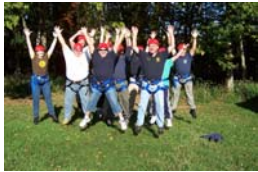
WC EMS Excited to Climb!