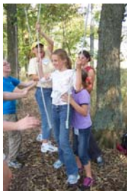
Big Brothers Big Sisters Day on the Course!