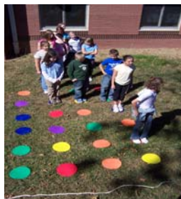
Kingston Elementary tackling the "Maze".