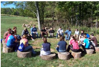
A debrief at the "Sycamore Circle".

groups. We are so excited about this and are looking forward to the spring! We are already booking groups for 2008 so call us to schedule your group today!