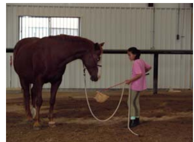
A home school student desensitizing Doc to a "scary" plastic bag.