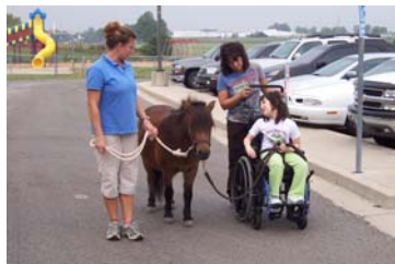
A student at Shannon Johnson Elementary learns how to lead Amigo.