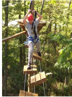
A member of the Woodford Co. EMS runs on the "lily pads".