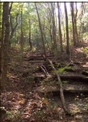
This fall, explore the trails at Life Adventure Center

With the help of some hard working Eagle Scouts, the trail system at LAC is nearing completion. Trails, bearing names that highlight the center's history and natural diversity, are being marked with signs created from recycled fencing from our farm. Sites for a teaching garden and wildlife viewing blinds have been selected and building designs are being studied. Staff have been busy forming partnerships with Fayette County 4-H to provide facilities for their busy environmental education program.