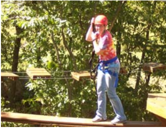
A Berea College student tackling the high course!

The Challenge Course at LAC has had over 700 participants since July! Groups on the course include schools, athletic teams, church youth groups, scouting groups, and corporate