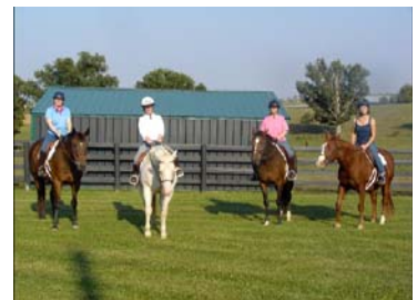
Women's Riding Group enjoying the beautiful fall weather!