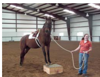
Woodford Co. High School student works with Sam to build trust.

This fall, students in our Home School and After School Programs are learning about natural horsemanship. The students are learning how to communicate with horses in a language they understand. Through various groundwork exercises, the students are learning how to communicate nonverbally with the horses, teaching the horses to respect them, and desensitizing the